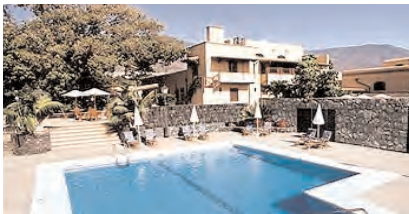
Finca Salamanca Güímar