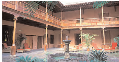
La Quinta Roja Garachico