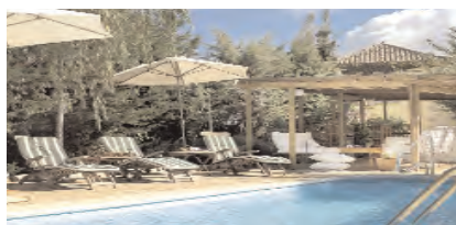
Hotel Rural Las Calas La Lechuza