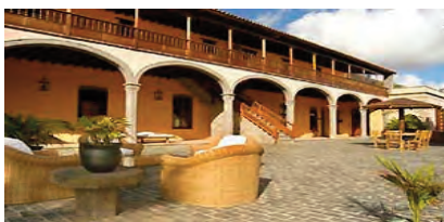
La Hacienda de Buen Suceso Arucas

For extra nights we recommend both hotels above.