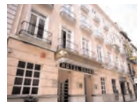
Hotel Dauro II