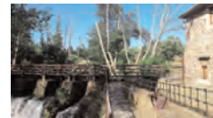
O Muino de Pena ★★★★ Rua, Day 9