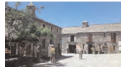
Hotel O'Cebreiro ★★★ O'Cebreiro, Day 3