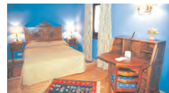
Posada Regia ★★★ Leon, Day 1