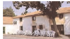
Casa de Los Somoza ★★ Melide, Days 7+8