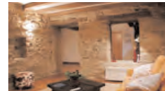
Rectoral de Lestedo ★★★★ Lestedo, Day 6