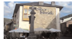
Posada de Muriel ★★★ Molinaseca, Day 2