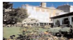
Virxe da Cerca ★★★★ Santiago de Compostela, Day 10

For extra nights we recommend Leon and Santiago, and city add-ons can be arranged in Madrid.