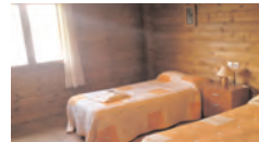
Casa Rural Sta Maria ★★ Portomarin, Day 5