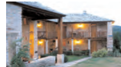
Rectoral de Goian ★★★★ Sarria, Day 4