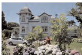
Serra Golf ★★★★★ Santo da Serra Days 4+5