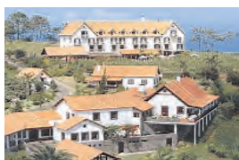
Quinta do Furão ★★★★★ Santana Days 1+2+3