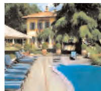
Villa Beccaris ★★★★ Monforte d'Alba Days 6+7

For extra nights we recommend Benevello or Monforte d'Alba.