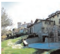
Casa Pavese ★★★★ Grinzane Cavour Days 2+3