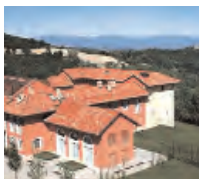
Relais Villa d'Amelia ★★★★ Benevello Days 1+8