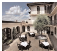
Le Torri Hotel ★★★ Castiglione Falletto Days 4+5