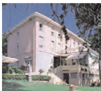
Hotel Beatrice d'Este ★★★★ Este Days 2+3