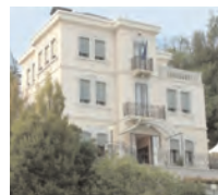
Villa Lussana ★★★★ Teolo Days 6+7

For extra nights we recommend Teolo, and city add-ons can be arranged in Venice and Verona.