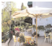
Hotel Belvedere ★★★★ Galzignano Terme Days 4+5