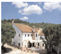
Agriturismo Il Feudo Cortelà Days 1+8