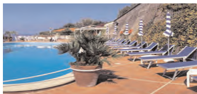
Hotel Bellavista Massa Lubrense