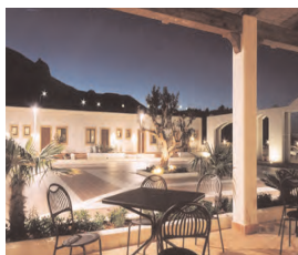
Tenute Plaia Agriturismo ★★★★ Scopello Days 1+2