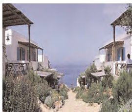
Marettimo Residence ●●●● Marettimo Days 3+4+5