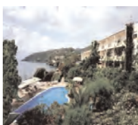
Hotel Giardino Sul Mare