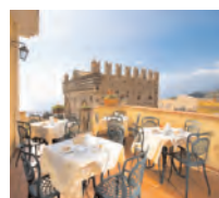
Hotel del Corso