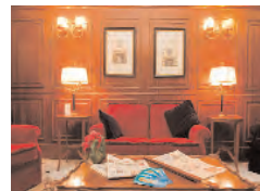
Hotel Firenze e Continentale ★★★ La Spezia Days 1+2+3