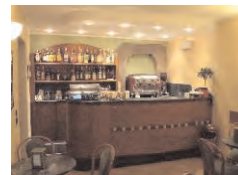
Hotel La Luna ★★★ Lucca Days 9+10

For extra nights we recommend Florence and Lucca.