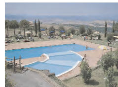
Hotel Palazuolo ★★★ San Quirico d'Orcia Days 6+7+8