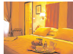
Hotel Cosimo de Medici ★★★ Florence Days 4+5