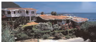
Hotel Costa Dorada Cala Gonone