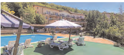
Hotel Sa Muvara Aritzo