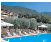
Hotel la Terrazza ★★★