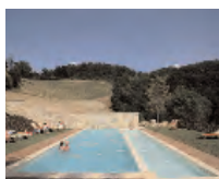
La Tavola dei Cavalieri ★★★★