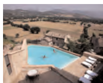
La Bastiglia ★★★★ Spello