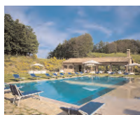
Le Silve ★★★★