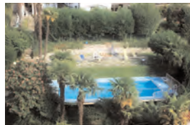
Hotel Excelsior Splendide