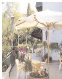
Hotel Belvedere ★★★★ Galzignano Terme Days 2+3