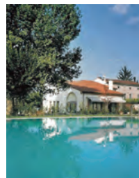
Agriturismo L'Albara ★★★★ Villaganzerla Days 6+7

For extra nights we recommend Teolo and Villaganzerla, and city add-ons can be arranged in Venice and Verona.