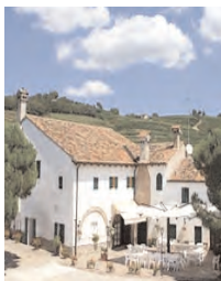
Agriturismo Il Feudo Cortelà Days 1+8