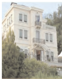
Villa Lussana ★★★★ Teolo Days 4+5