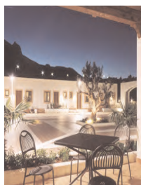
Tenute Plaia Agriturismo ★★★★ Scopello Days 1+2