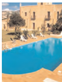
Baglio Fontana ★★★★ Buseto Palizzolo Days 3+4