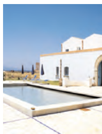
Relais Antiche Saline ★★★★ Nubia Days 5+6