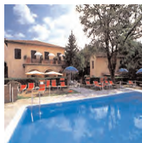
Hotel Le Renai ★★★★ Pancole Days 6+7

For extra nights we recommend Volterra and optional 2-night extension in Colle di Val d'Elsa. City add-ons can be arranged in Florence and Siena.