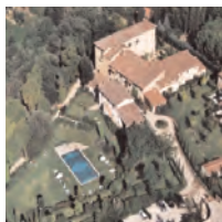
Relais della Rovere ★★★★★ Colle di Val d'Elsa Days 4+5 (plus extension)