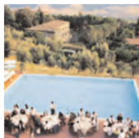
Park Hotel Le Fonti ★★★★ Volterra Days 1+8