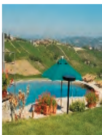
Albergo Castiglione ★★★★ Castiglione Tinella Days 2+3