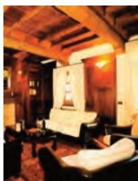
Casa Pavesi ★★★★ Grinzane Cavour Days 4+5