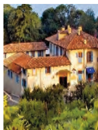
Villa Beccaris ★★★★ Monforte d'Alba Days 6+7

For extra nights we recommend Benevello and Monforte.