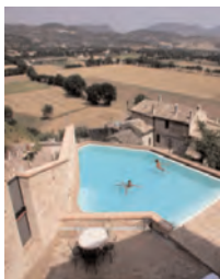
La Bastiglia ★★★★ Spello Days 1+8