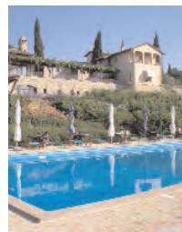
Ripa Relais Colle del Sole ★★★★ Ripa Days 6+7

For extra nights we recommend Spello and Spoleto, and city add-ons can be arranged in Perugia and Rome.