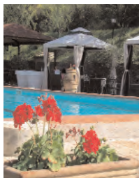
Poggio dei Pettirosi ★★★★ Bevagna Days 4+5