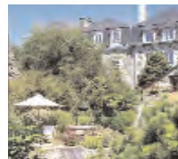
Hotel d'Avaugour ★★★ Dinan Days 6+7

For extra nights we recommend Lamballe and Dinan.