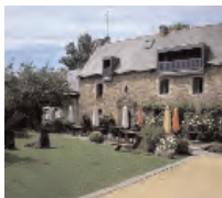
Le Manoir des Portes ★★ Lamballe Days 1+8