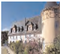
Hotel de Diane ★★★ Sables d'Or-Les-Pins Days 2+3