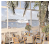
Hotel Printania ★★★ Dinard Days 4+5