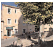
Hotel Ste Anne ★★★★ Apt Days 2+3