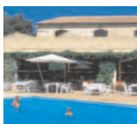
Hotel les 3 Colombes ★★★★ St Didier Days 1+8