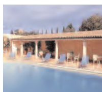
Hotel la Bergerie ★★★ Joucas Days 6+7

For extra nights we recommend St Didier and Roussillon.