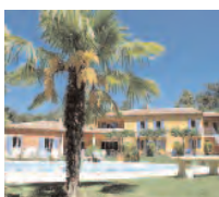
Hotel les Sables d'Ocre ★★★ Roussillon Days 4+5