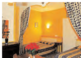
Hotel de France et Guise ★★ Blois