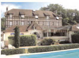
Hostellerie du Château ★★★ Chaumont