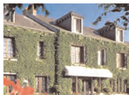
Auberge du Centre ★★★ Chitenay