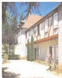
Hostellerie Meysset ★★★ Sarlat Days 1+8