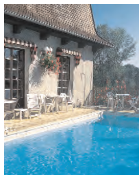
Hostellerie Fenelon ★★★ Carennac Days 2+3