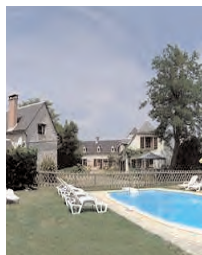
Hotel Grangier ★★★ St Sozy Days 4+5