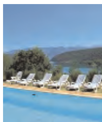
Hotel les Cavalets ★★ Bauduen Days 4+5 (plus extension)