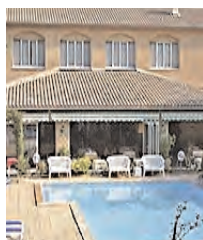
Hostellerie de l'Abbaye ★★ Le Thoronet Days 1+8