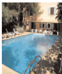
Hotel le Rouge Gorge ★★ Pontevès Days 2+3