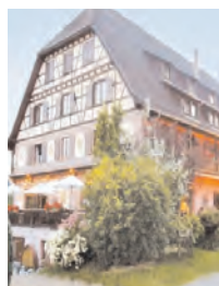
Hotellerie Le Verger des Châteaux ★★★ Dieffenthal Days 6+7

For extra nights we recommend Ammerschwihr and Rouffach, and city add-ons can be arranged in Strasbourg.