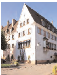
Aux Armes de France ★★ Ammerschwihr Days 1+8