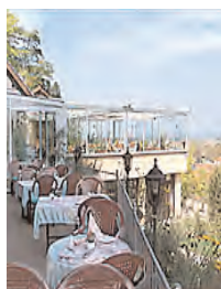
Hotel Kapuzinegarten ●● Breisach am Rhein Days 4+5