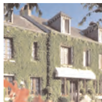
Auberge du Centre ★★★ Chitenay Days 6+7

For extra nights we recommend Chissay and Chaumont, and city add-ons can be arranged in Paris.