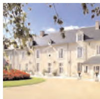
Manoir Bel Air ★★★ St Dye-sur-Loire Days 4+5