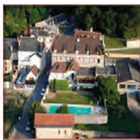
Hostellerie du Château ★★★★ Chaumont Days 2+3