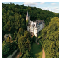
Château de Chissay ★★★★ Chissay Days 1+8