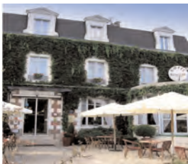
Hotel Normandie ★★ Auxerre Days 1+6