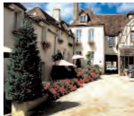
Relais St Vincent ★★ Ligny-le-Chatel Days 2+3