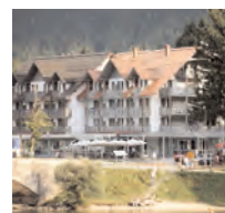
Hotel Jezero ★★★★ Bohinj