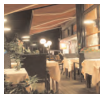
Hotel Hvala ★★★★ Kobarid