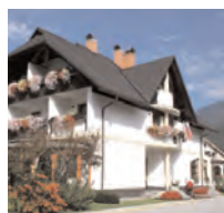
Hotel Miklic ★★★★ Kranjska Gora