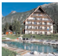
Hotel Mangart ★★★ Bovec