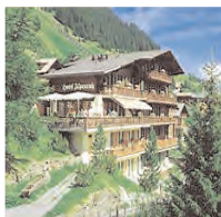
Hotel Alpenruh ★★★ Mürren