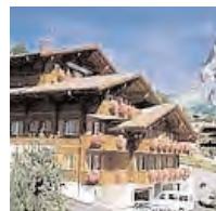
Chalet Hotel Alte Post ★★★ Grindelwald