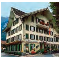
Hotel Baeren ★★★ Wilderswil