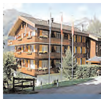
Hotel Bellevue ★★★ Wengen