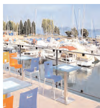
Hotel Beaulac ★★★★ Neuchatel Days 2+3