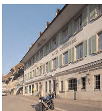
Hotel Krone ★★★ Aarberg Days 1+8