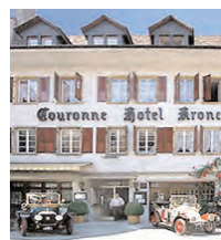
Hotel Murtenhof and Krone ★★★ Murten Days 6+7

For extra nights we recommend Aarberg and Murten.