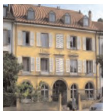
Hotel du Theatre ★★★ Yverdon les Bains Days 4+5