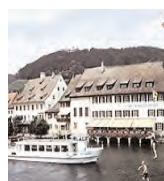
Hotel Rheinfels ★★★★ Stein am Rhein Days 4+5