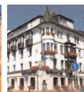
Hotel Buchhornerhof ★★★★ Friedrichshafen Days 8+9

For extra nights we recommend Bregenz and Konstanz.