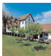
Hotel Seegarten ★★★★ Arbon Days 2+3