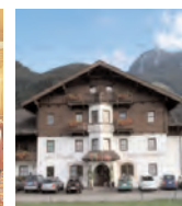
Hotel Bergrose ★★★★ Strobl Days 8+9

For extra nights we recommend optional 2-night extension in Bad Ischl, and city add-ons can also be arranged in Salzburg.