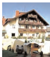
Hotel Attergauhof ★★★★ St Georgen Days 2+3