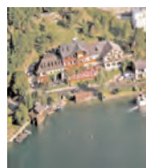
Hotel Grunberg ★★★★ Gmunden Days 4+5