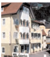
Hotel Leitnerbrau ★★★★ Mondsee Days 1+10