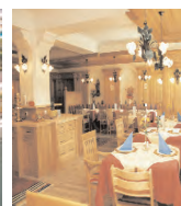
Landhotel Hubertushof ★★★★ Bad Ischl Days 6+7