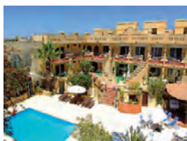
Hotel Cornucopia ★★★★ Xaghra Days 2+3