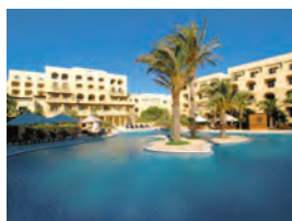
Kempinski San Lawrenz ★★★★★ San Lawrenz Days 4+5

For extra nights we recommend any of the above hotels, and city add-ons can also be arranged in Malta.