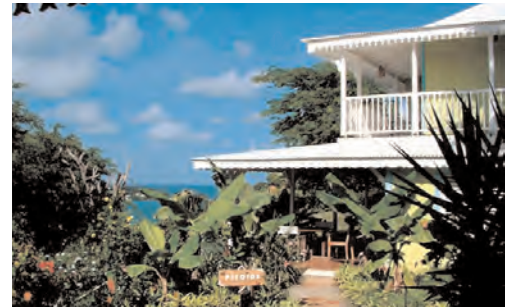
Hotel Plein Soleil Le François, Martinique