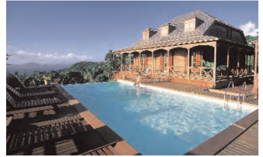
Jardin Malanga Trois Rivières, Guadeloupe