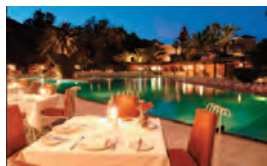
Hotel Karam Palace ★★★★