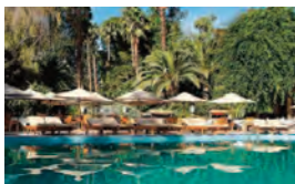
Hotel Es Saadi ★★★★★