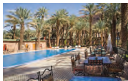
Hotel Palais Asmaa ★★★★