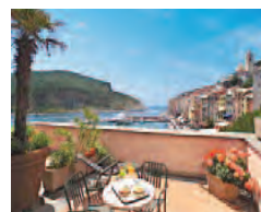
Grand Hotel Portovenere