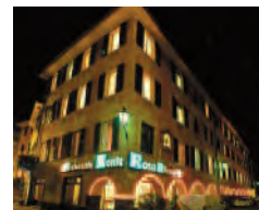
Monte Rosa Hotel